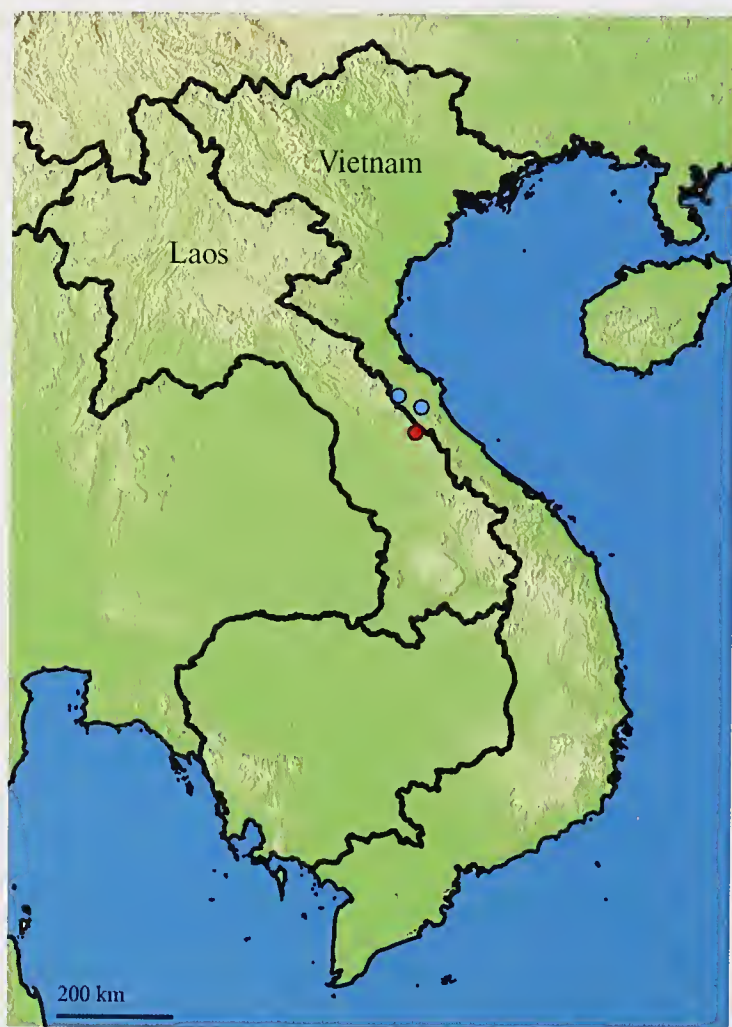
Fig. 1. Map showing the distribution of Gracixalus quyeti , including the localities of the type series after Nguyen et al. (2008) in Quang Binh Province, Vietnam (marked with blue dots) and our first record from Khammouane Province, Laos (marked with a red dot).